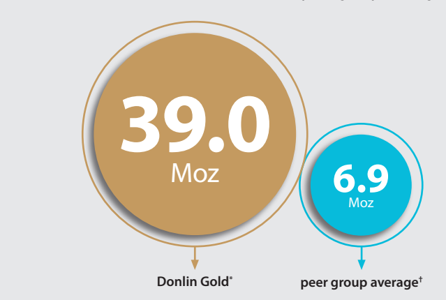
A resource five times the size of the peer group average.

* Donlin Gold project estimates as per the second updated feasibility study effective November 18, 2011 and amended January 20, 2012. Represents 100% of measured and indicated resources, of which NOVAGOLD's share represents 50%. Measured and indicated resources are inclusive of proven and probable reserves. Measured resources total 8M tonnes grading 2.52 g/t Au, and indicated resources total 534M tonnes grading 2.24 g/t Au. Proven reserves total 8M tonnes grading 2.32 g/t Au, and probable reserves total 497M tonnes grading 2.08 g/t Au. † Peer group data based on company documents, public filings and websites. Comparison group of 17 projects based on large (2Moz P&P cut off), North/South American gold-focused development projects with >75% projected revenues from gold.